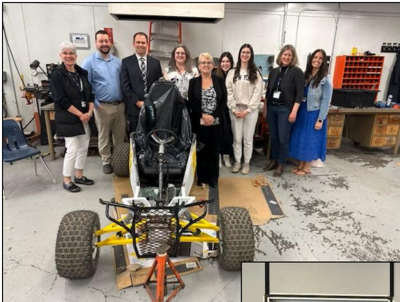
The Board of Education was in Tumbler Ridge for the May Board Meeting.