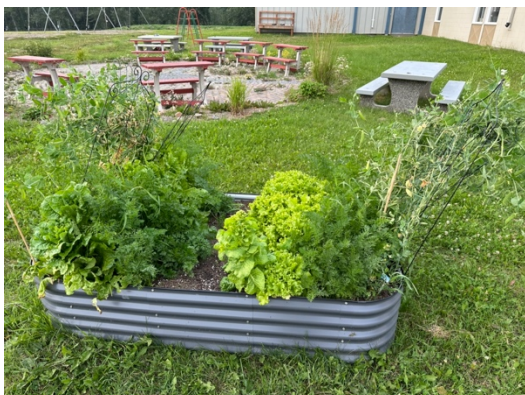
McLeod Garden Boxes

Please read McLeod Elementary School's Code of Conduct. It includes conduct expectations, our new digital device policy, and dress code. Please, review the expectations with your child. The code of Conduct will be available to review on our website as well.